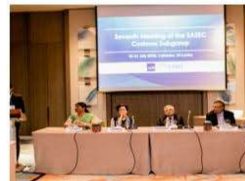
30 – 31 July 2018 Colombo, Sri Lanka