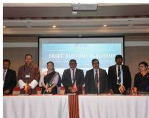
14 – 15 June 2017 Thimphu, Bhutan