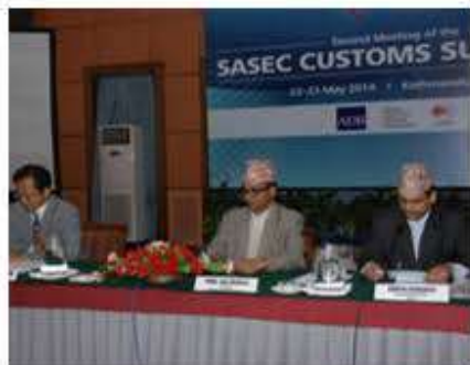
22 – 23 May 2014 Kathmandu, Nepal