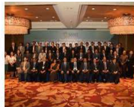
27 – 28 October 2015 Cebu, Philippines