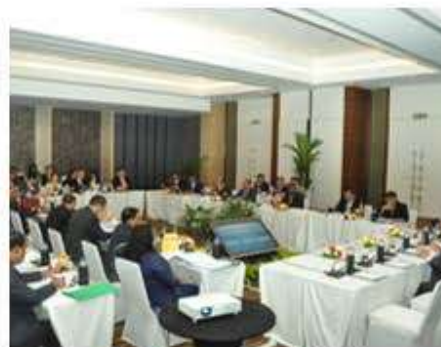
11 – 12 March 2015 Goa, India