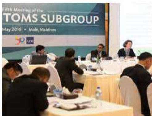
25 – 26 May 2016 Male, Maldives