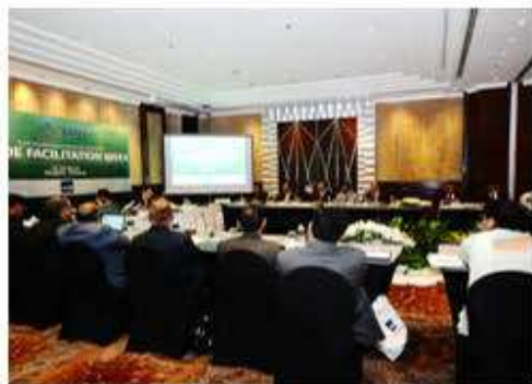
28 March 2013 Bangkok, Thailand