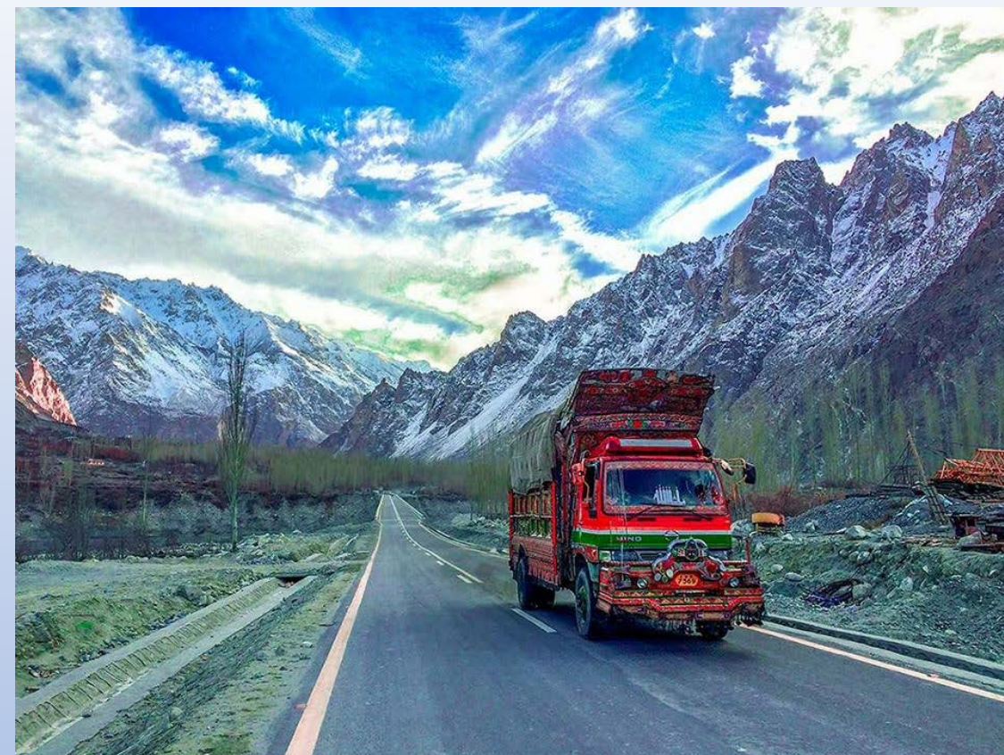
Truck traveling along the Karakoram Highway

Source: State Bank of Pakistan, 2019. Export of Goods and Services by Country.