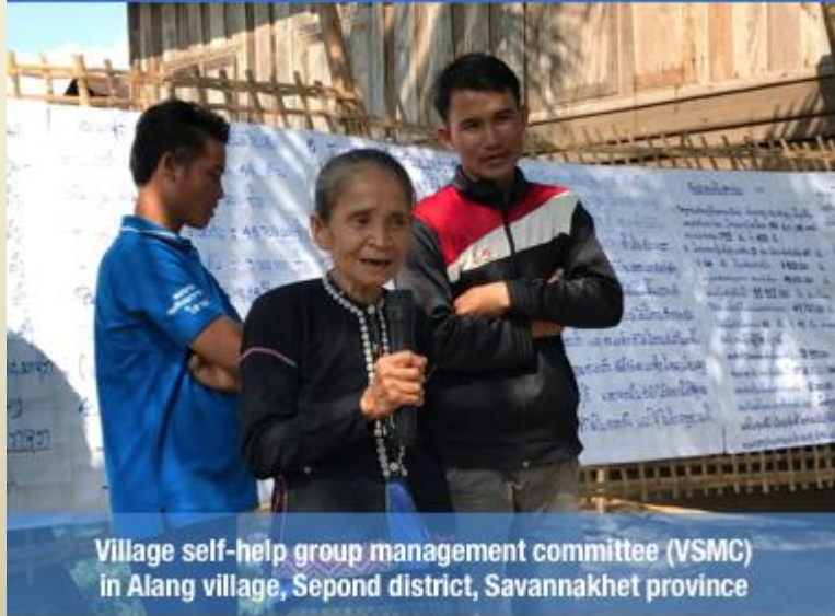
Village self-help group management committee (VSMC) in Alang village, Sepond district, Savannakhet province