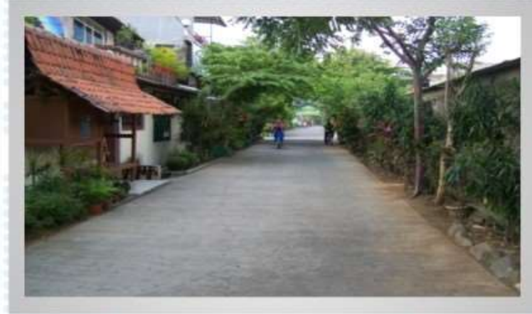
BATUCEPER INDAH RW 08