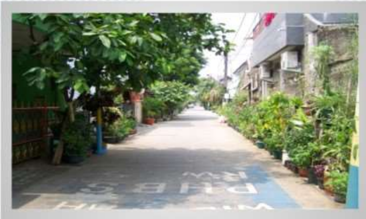
PEDURENAN RW 05