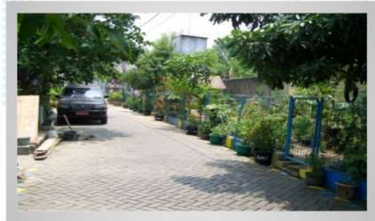
BUGEL MAS INDAH RW 03