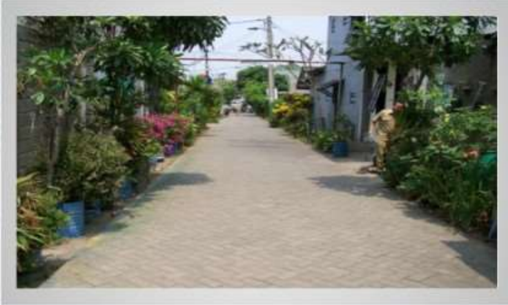
CIBODAS CILIWUNG RW 07